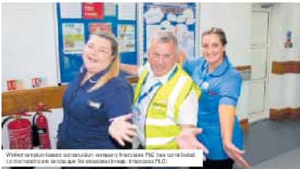
Wolverhampton-based construction company Interclass PLC has contributed to enhancing care facilities for decades (Image: Interclass PLC)

INTERCLASS IS PROUD TO BE SUPPORTING NHS HOSPITALS ACROSS THE REGION IN THEIR INVALUABLE WORK